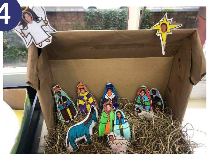
U5 BWS - Brewer/Smith