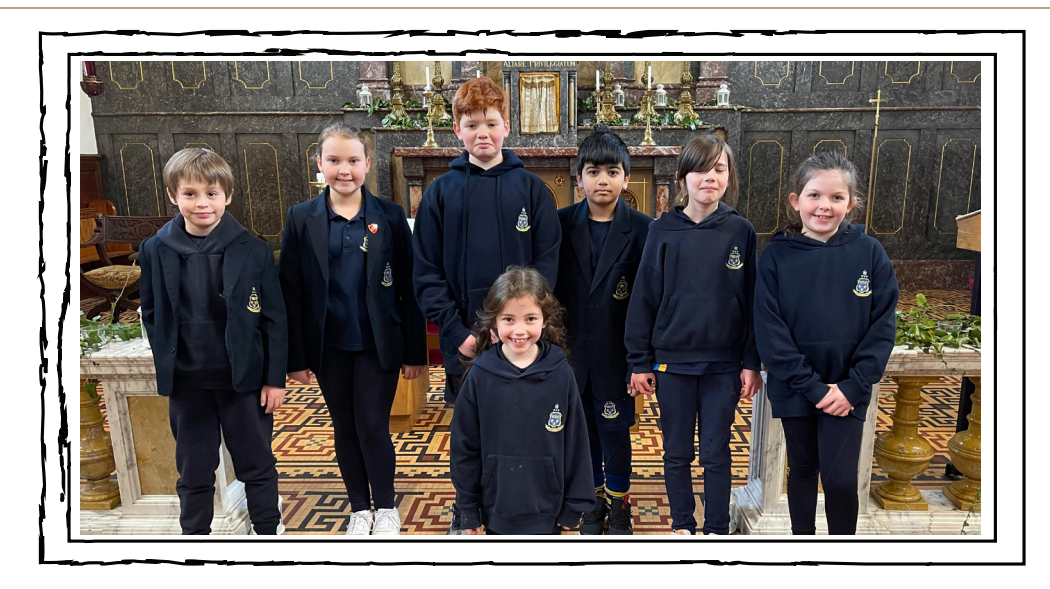
Stars of the Week