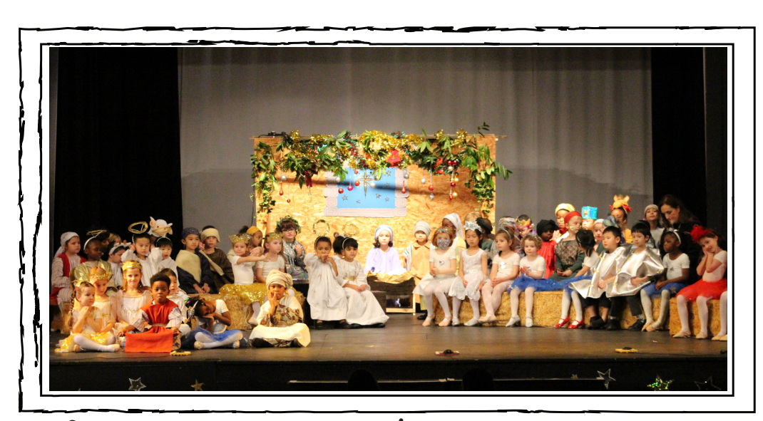
Class of the Week - Nursery, Prep 1 & Prep 2