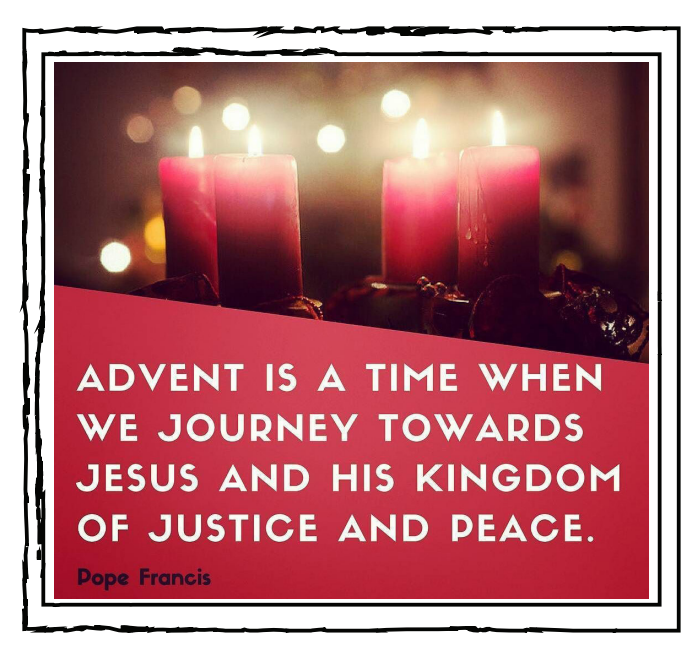
Word of the Week