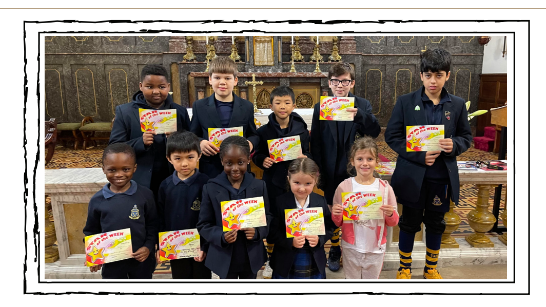
Stars of the Week