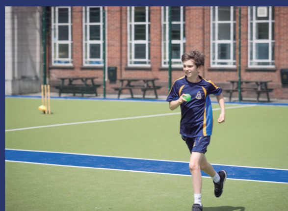
Highlighting Sport, Fitness and Well-being.

Newly refurbished outdoor play provision, including our environmentally friendly, solar-powered outdoor classroom.