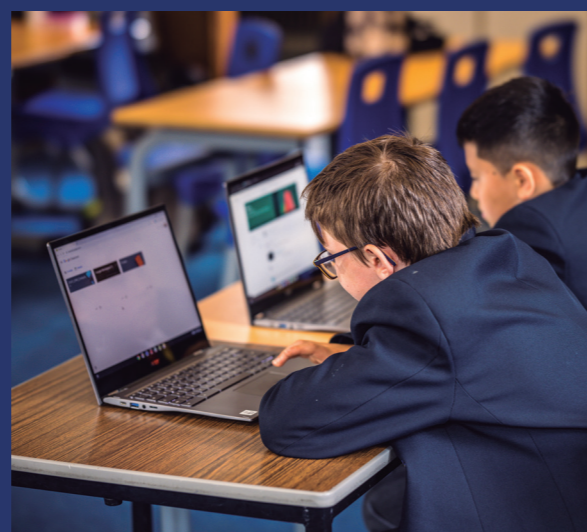
New high-speed Wi-Fi network throughout the College.

At St Bede's, we strive to be the best we can be. Changing for the better is an essential part of the DNA of our College, which is one big family. We are committed to the overall satisfaction of parents, the human and professional quality of our teachers and employees and our students. At St Bede's, we believe everything works better with the cooperation of everyone. Over the past 12 months there have been improvements in the infrastructure of the College which have improved our facilities, making our positive atmosphere even better! We are proud of these changes that everyone can enjoy.