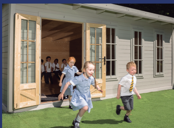
Prep School playground.

Newly refurbished outdoor play provision, including our environmentally friendly, solar-powered outdoor classroom.