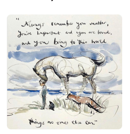
Word of the week