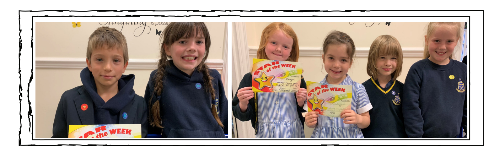
Housepoint Winners and Stars of the Week - Prep 3 Prep 1 & 2