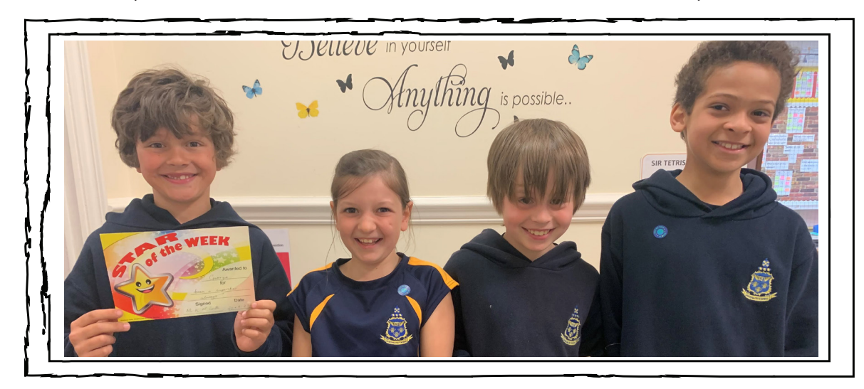
Housepoint Winners and Stars of the Week - Prep 3 & 4