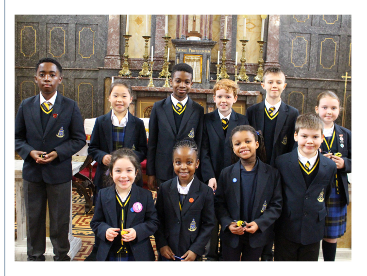
CLASS OF THE WEEK - Reception