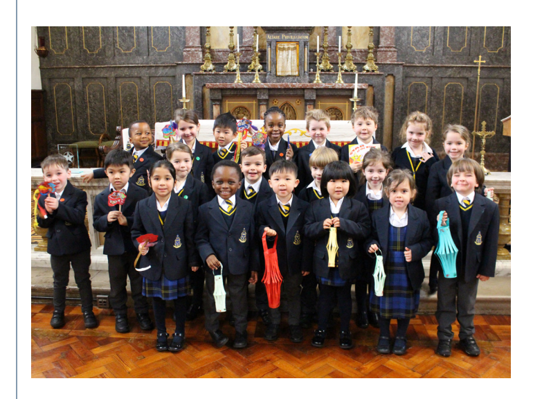
STARS OF WEEK