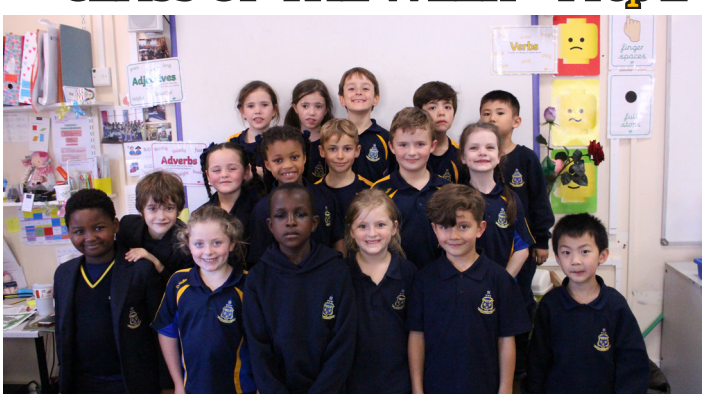
STARS OF WEEK