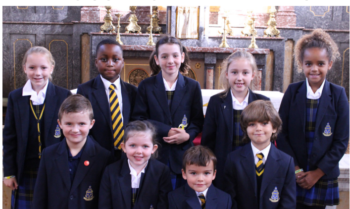
CLASS OF THE WEEK - Prep 4