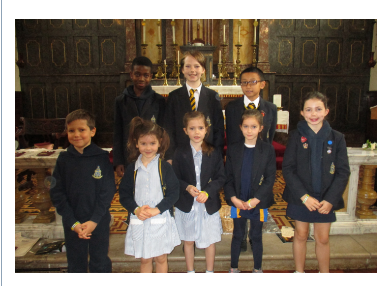
CLASS OF THE WEEK - Prep 4C