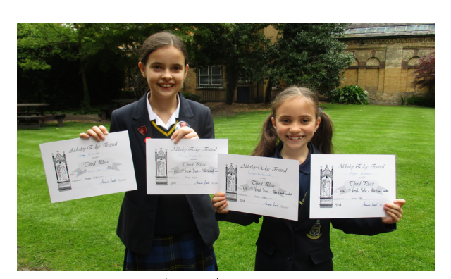
SINGING AWARD WINNERS